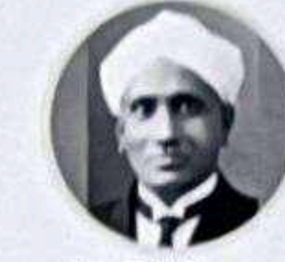
Sir. C.V. Raman Nobel Laureate & Alumnus

UGC-Sponsored Two - Day National Conference on "Science of Disaster Management" 23 rd & 24 th November 2019