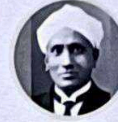
Sir. C.V. Raman Nobel Laureate & Alumnus