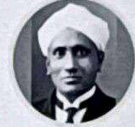
Sir. C.V. Raman Nobel Laureate & Alumnus