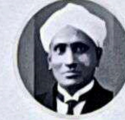
Sir. C.V. Raman Nobel Laureate & Alumnus

UGC-Sponsored Two - Day National Conference on "Science of Disaster Management" 23 rd & 24 th November 2019