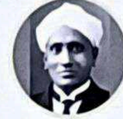
Sir. C.V. Raman Nobel Laureate & Alumnus