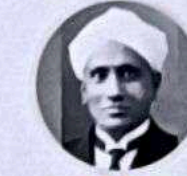
Sir. C.V. Raman Nobel Laureate & Alumnus